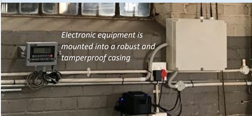
Electronic equipment is mounted into a robust and tamperproof casing