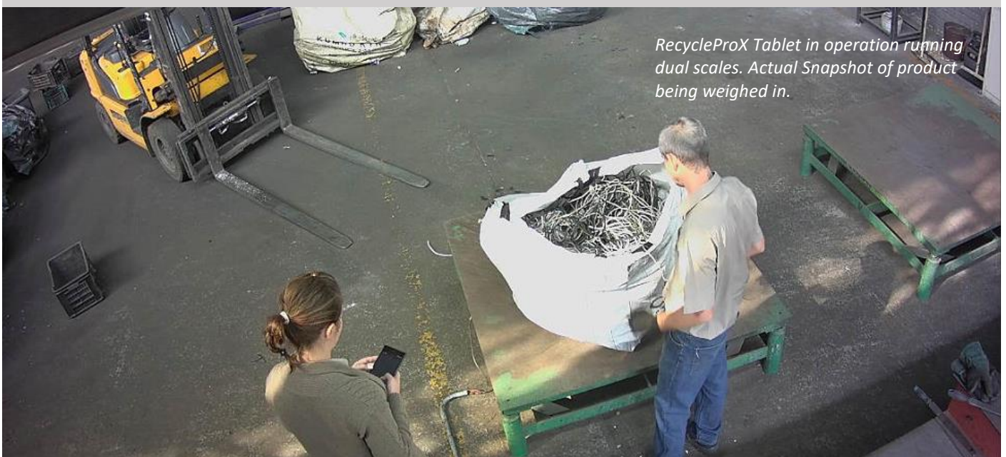
RecycleProX Tablet in operation running dual scales. Actual Snapshot of product being weighed in.